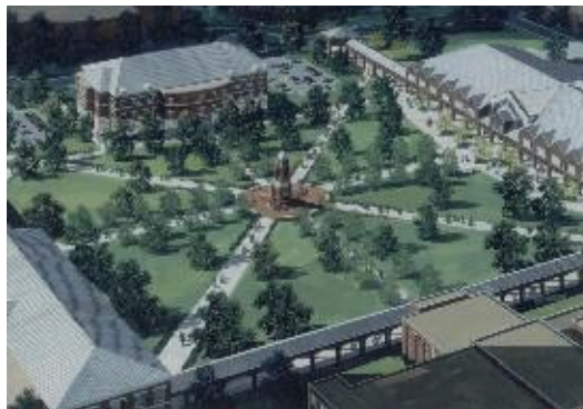
UAPB Master Plan Rendering

include Academic Buildings I and II, a new science building, numerous infrastructure improvements and various renovations.