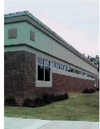
Southeast Arkansas College Library/Learning Resource and Nursing and Allied Health Center