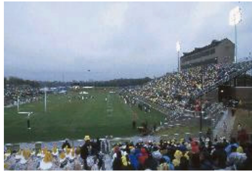
Rain does not dampen spirits of homecoming crowd at Golden Lion Stadium

seats. Indoor seating for 160 is provided on what is known as the "Golden Lions Den" floor of the press box facility. Future expansion plans include a seating capacity of up to 28,000 fans.