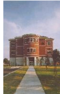
University of Arkansas at Pine Bluff School of Business and Management