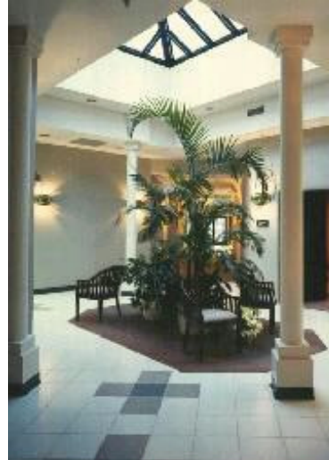
Pine Bluff Corporate Center Atrium

WE'RE ON THE WEB! WWW.NELSONARCHGROUP.COM